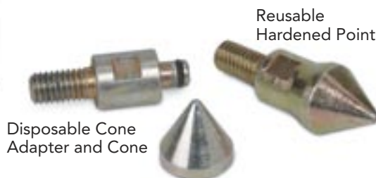
Disposable Cone Adapter and Cone

Humboldt provides several different models of Dynamic Cone Penetrometers; on the back are the most popular, give us a call to determine which is the right one for you.