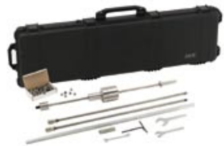
Typical Dual Mass Penetrometer Kit

Additional cones and spare parts for all DCPs are available, please inquire.